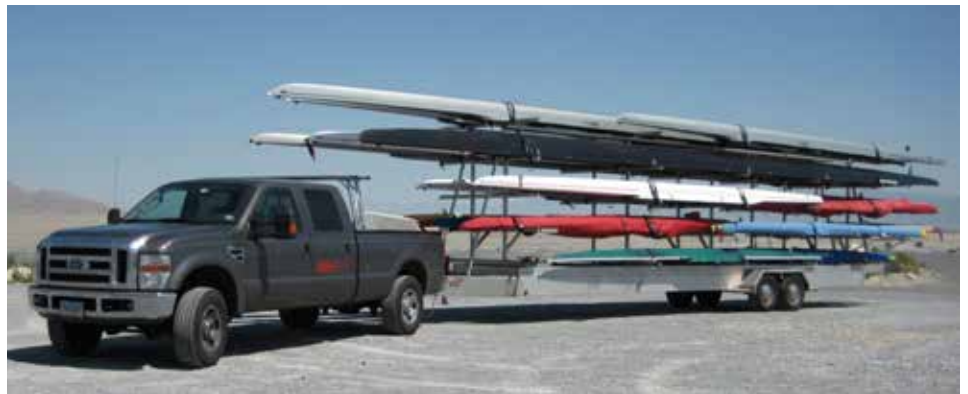
Figure 2: Example of a trailer combination transporting rowing shells

Please note that the vehicle towing the trailer must have a Gross Vehicle Mass (GVM) of less than 4.5 tonnes. Likewise, the trailer transporting the equipment must have an Aggregate Trailer Mass (ATM) of less than 4.5 tonnes. The GVM and ATM of your vehicle and trailer are specified by the manufacturer.