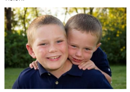
Full healthy vision

The following images provided by the Vision Initiative are indicative of possible visual changes associated with cataracts compared to normal vision.