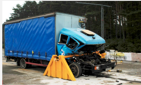
VSB Gate: Narrow impact point will focus energy into the occupant compartment causing undue risk to errant vehicles. This device should be located such that it cannot be impacted by errant vehicles.