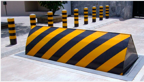
VSB Bollard: Similar severity to other roadside hazards, does not present undue risk to occupants or others, must be located within a low speed environment.

Like protection bollards, it is acknowledged that many vehicles can manage energy transfer during a low-speed impact, assuming the device does not present an undue risk during impact such as the potential to penetrate the vehicle or cause harm to others. As such, it is critical that VSBs are designed (shaped), positioned and orientated with an errant vehicle impact in mind. This includes smooth surfaces, rounded edges and a large contact surface that will distribute energy. Components that are likely to leave the system during impact or may spear a vehicle must be avoided. Physical crash testing is the preferred method of testing.