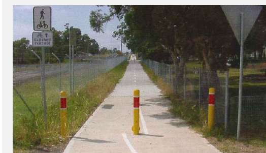
Steel Bollard: Access restriction, containment unknown, impact behaviour unknown.