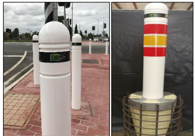
Figure 1. Energy Absorbing Bollard

The Energy Absorbing Bollard should be designed, installed and maintained in accordance with the following VicRoads conditions for use.