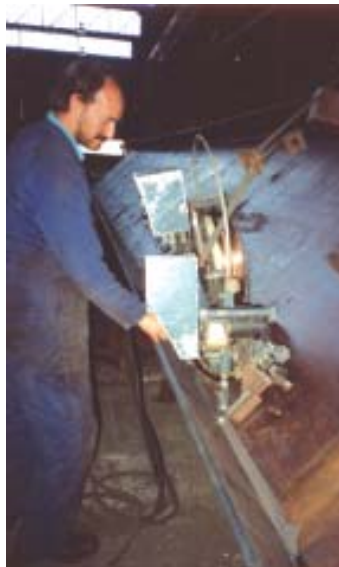
Figure 2.1 Welding, including automated procedures such as submerged arc welding, requires assurance that it has been carried out according to quality specifications.

The contents of this Guide specifically address Contractor surveillance activities associated with the implementation of that portion of the Quality Plan covering processes associated with fabrication and erection of structural steelwork. The Quality Plan covering structural steelwork processes is generally owned by the Structural Steelwork Sub-contractor and is reviewed by the Contractor.