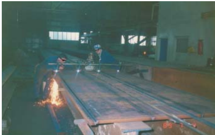
Figure 6.2 As part of surveillance, procedures such as balanced flame cutting of flange plates to avoid distortion, should be observed.