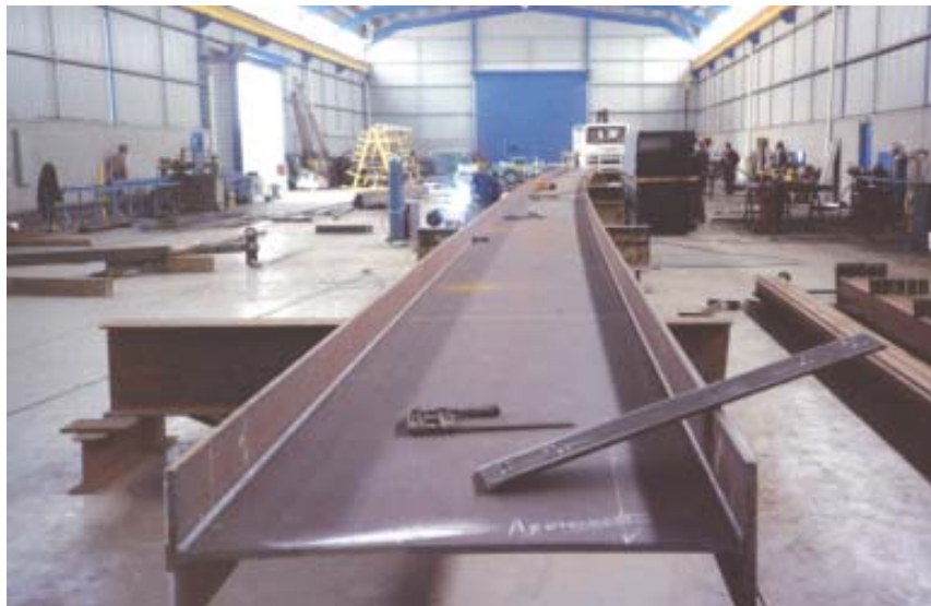
Figure 6.3 The Surveillance Officer must verify that the camber is within specifications and tolerances.