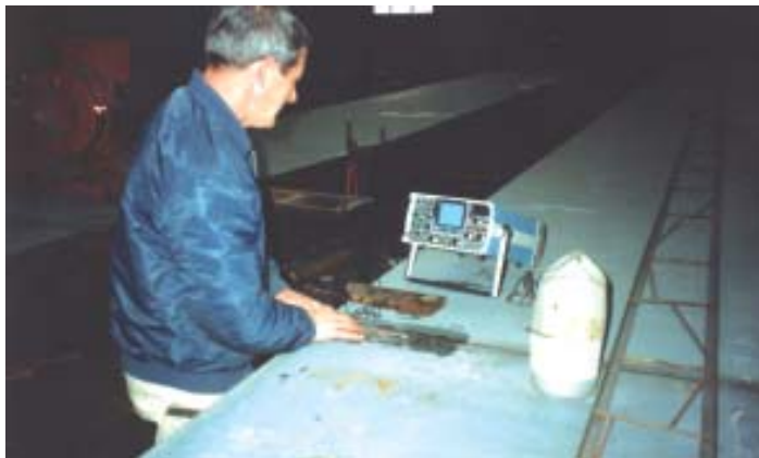
Figure 6.1 A surveillance officer must ascertain specified testing is carried out, such as this ultrasonic inspection of a butt weld