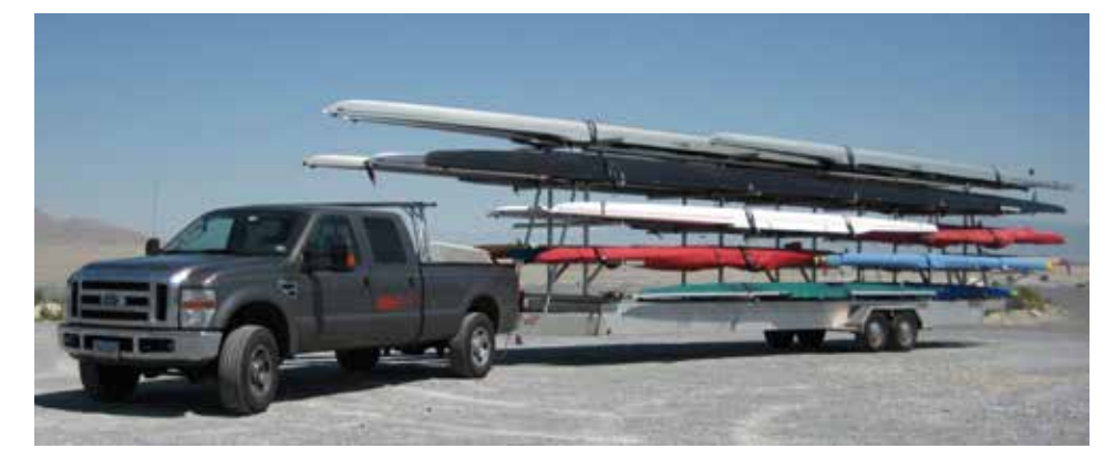
Figure 2: Example of a trailer combination transporting rowing shells

Please note that the vehicle towing the trailer must have a Gross Vehicle Mass (GVM) of less than 4.5 tonnes. Likewise, the trailer transporting the equipment must have an Aggregate Trailer Mass (ATM) of less than 4.5 tonnes. The GVM and ATM of your vehicle and trailer are specified by the manufacturer.