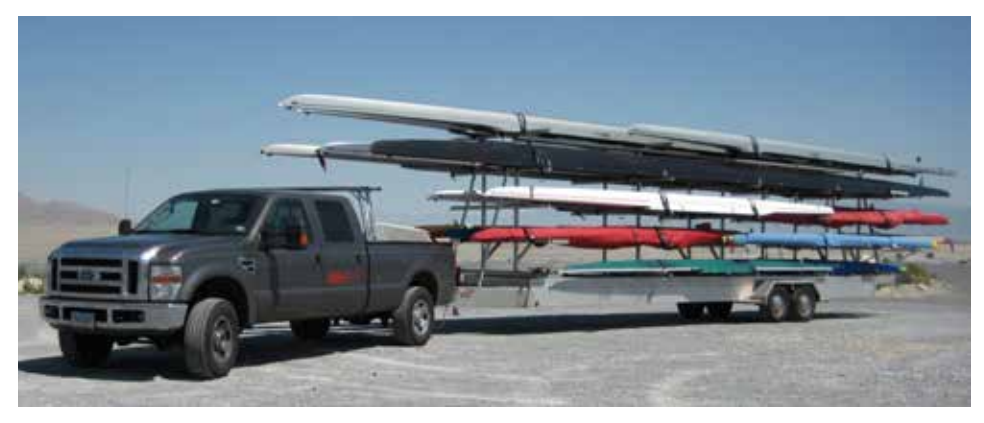
Figure 2: Example of a trailer combination transporting rowing shells

Please note that the vehicle towing the trailer must have a Gross Vehicle Mass (GVM) of less than 4.5 tonnes. Likewise, the trailer transporting the equipment must have an Aggregate Trailer Mass (ATM) of less than 4.5 tonnes. The GVM and ATM of your vehicle and trailer are specified by the manufacturer.