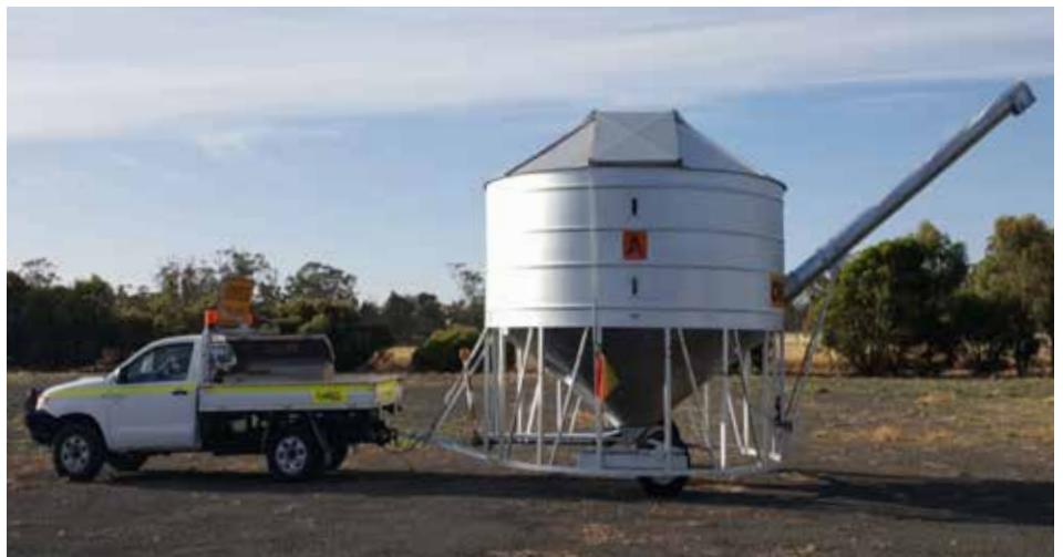
Figure 1: Field bin with an auger attachment towed by a light vehicle

Schedule 7 also features a section dealing specifically with agricultural vehicles and implements. This section recognises that agricultural equipment can be larger than the majority of Class O vehicles. In particular, augers and conveyors may have a rear overhang of 8.0 metres, while agricultural equipment operating in the Flat region of Victoria can be up to 6.0 metres wide.