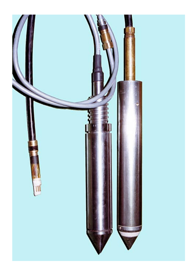
Figure 1: Fugro Piezo-Cone Penetrometer (Right) with standard Friction Cone Penetrometer (Left)

The Fugro Piezo-Cone Penetrometer can provide a great deal of information to the geotechnical engineer, by providing a continuous record of two parameters; cone resistance (q_c) and pore water pressure (u), which are functions of all major soil properties.